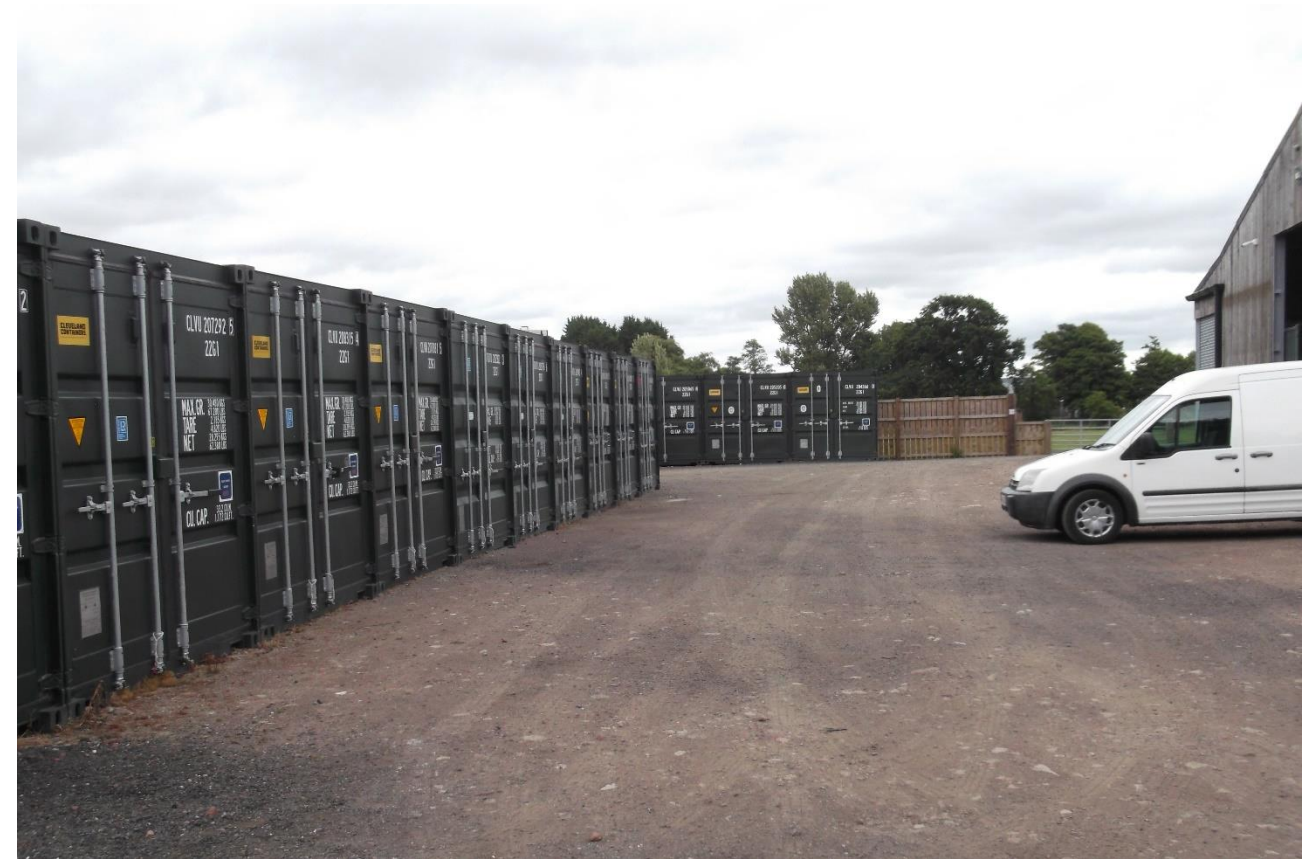
Containers sited externally