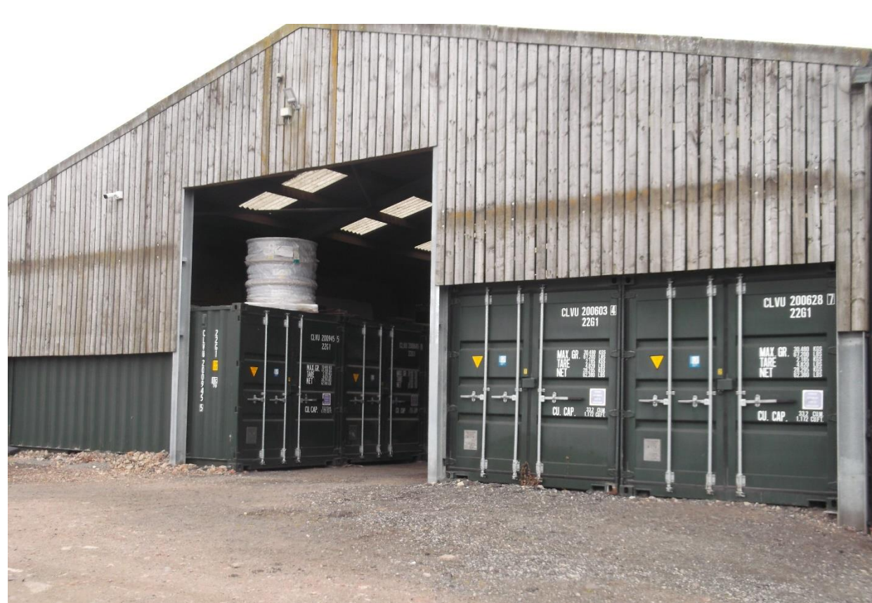
Containers in situ within building